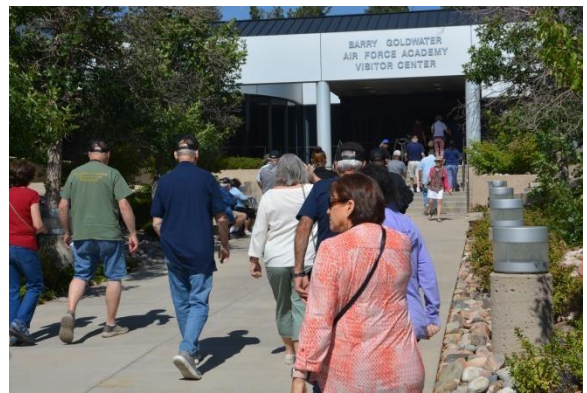
Near the end of the day, group visited the Visitor's Center and Gift Shop