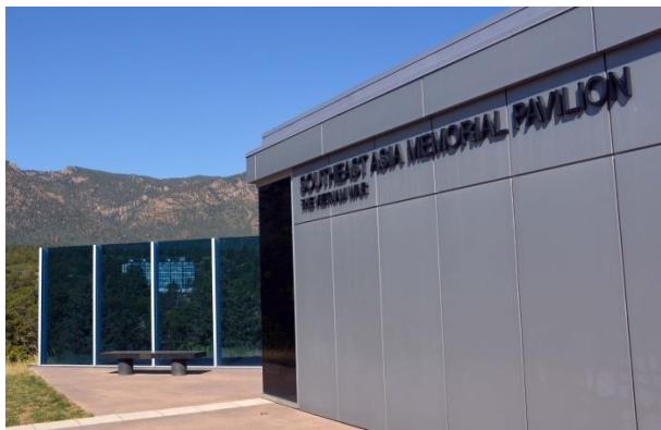
Southeast Asia Pavilion, funded by the Association of Graduates (AOG)