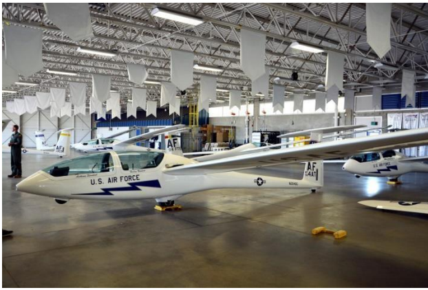
Cadets learn to fly using a glider at the Davis Airfield on Academy grounds