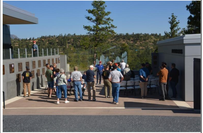
Lower Memorial Plaque display area for MIA and POW