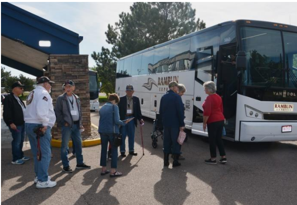
Another great day for a bus ride – this time to the USAF Academy