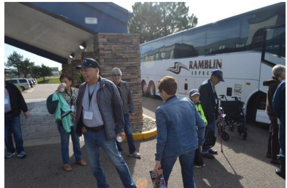
Rambin' Bus Co. provided service for both tours