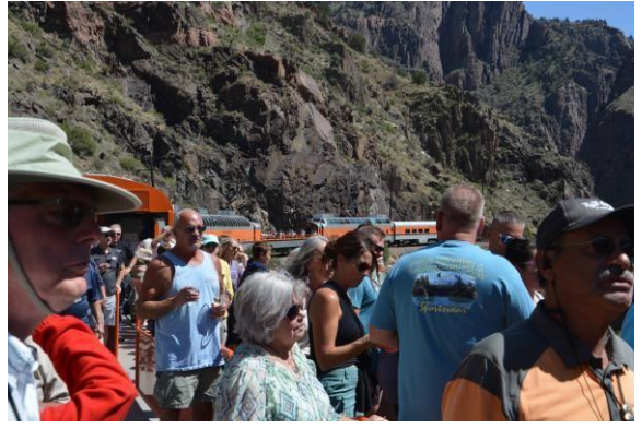
Open train car available to enjoy breathtaking ride through the gorge