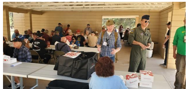
Lunch provided from Chick-fil-A at the "FamCamp" – Academy campgrounds