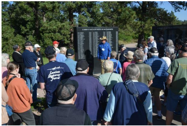
A "Docent" from Grad Class '69. Explaining the monument on the path to the SEA Pavilion